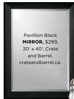
Pavilion Black MIRROR , $299, 30' x 40', Crate and Barrel, crateandbarrel.ca.