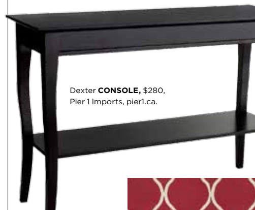
Dexter CONSOLE , $280, Pier 1 Imports, pier1.ca.