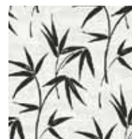
Sandpiper Studios Mondo Collection MN81000 WALLPAPER , $62 per roll, through designers, Crown Wallpaper & Fabrics, crownwallpaper.com.